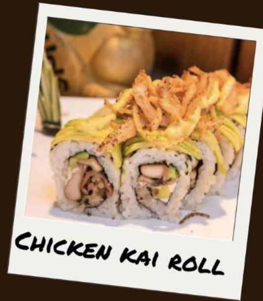
CHICKEN KAI ROLL